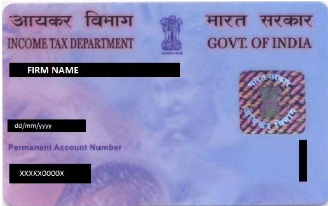
Img 2.1 Your PAN card