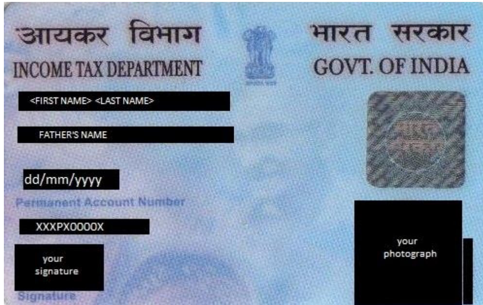
Img 1.3 Your PAN card (without middle name)

If your PAN card contains only your First Name and Last Name :